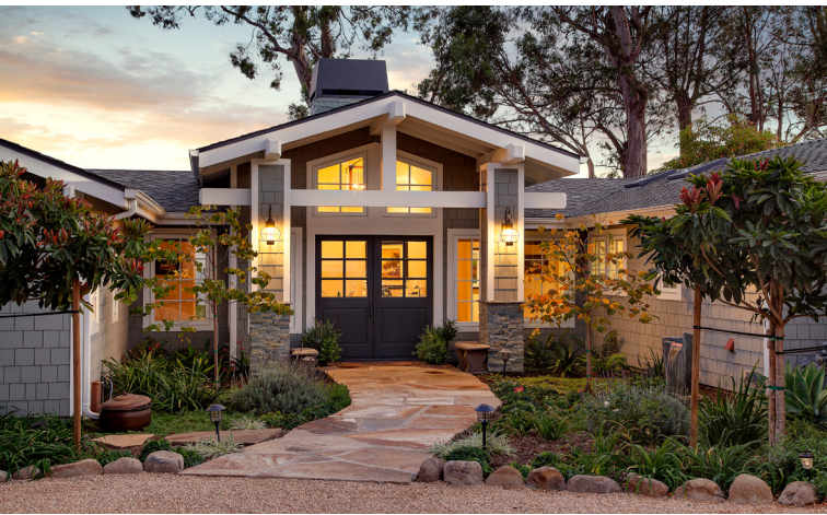
"We were able to move in two months ahead of schedule!"